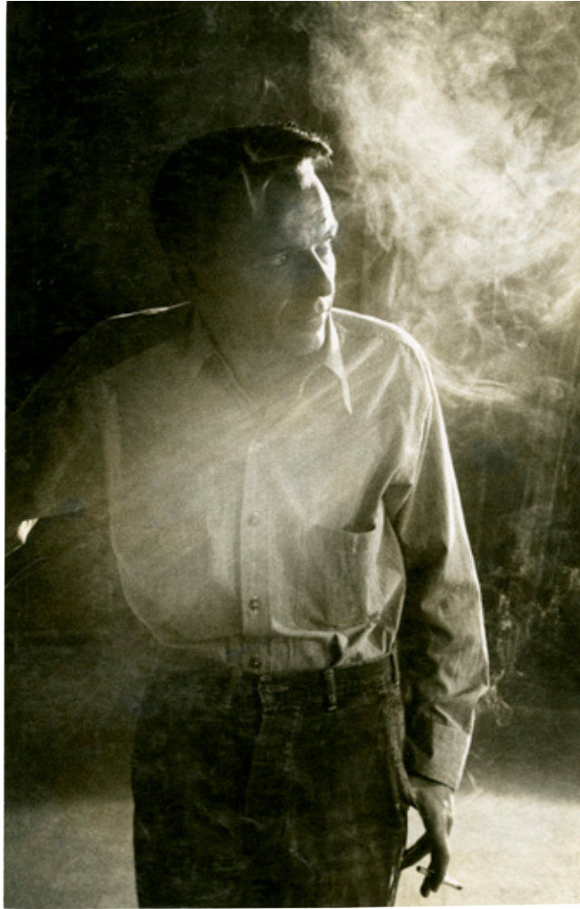
24 BOB WILLOUGHBY The Man with the Golden Arm Otto Preminger, 1955

Frank Sinatra on the set. Signed by Willoughby on the verso.