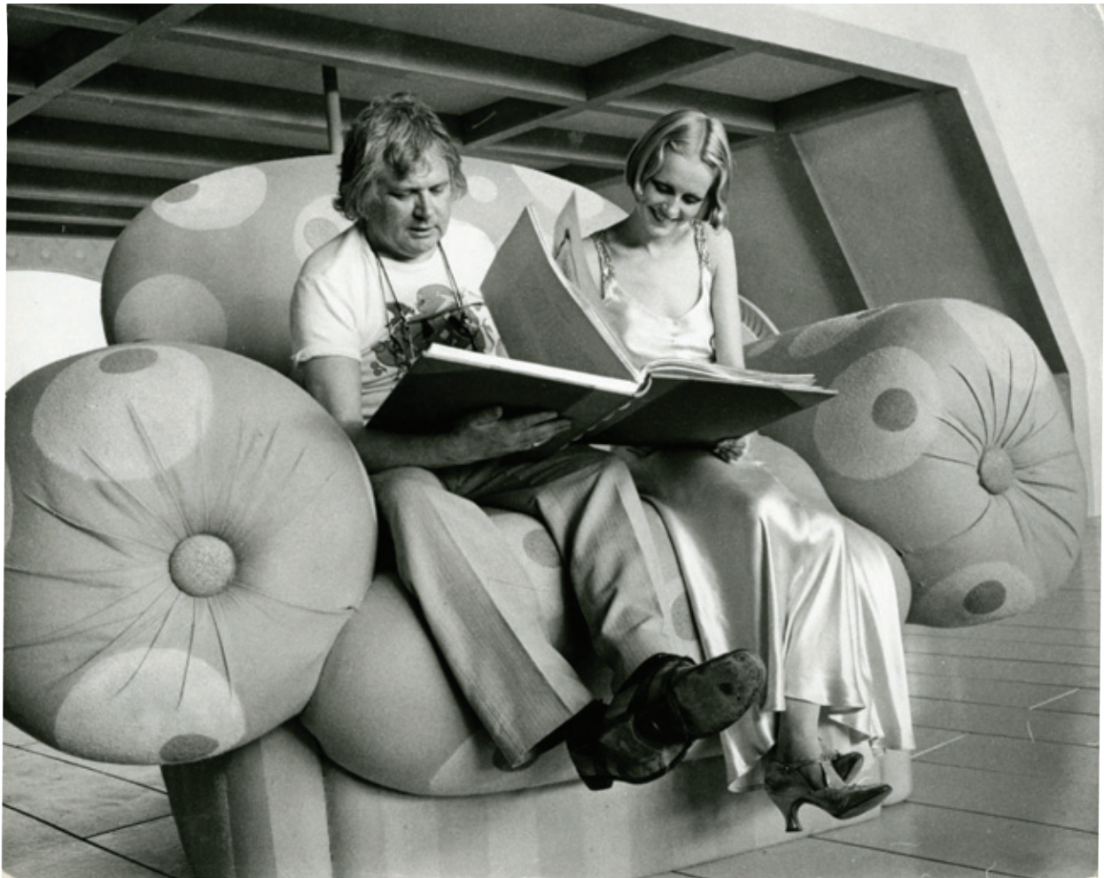
39 UNKNOWN The Boy Friend Ken Russell, 1971