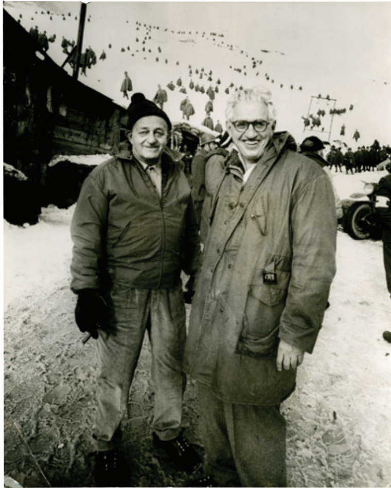
13 UNKNOWN A Farewell to Arms Charles Vidor, 1957

Screenwriter Ben Hecht and producer David O. Selznick on location in the Italian Alps.