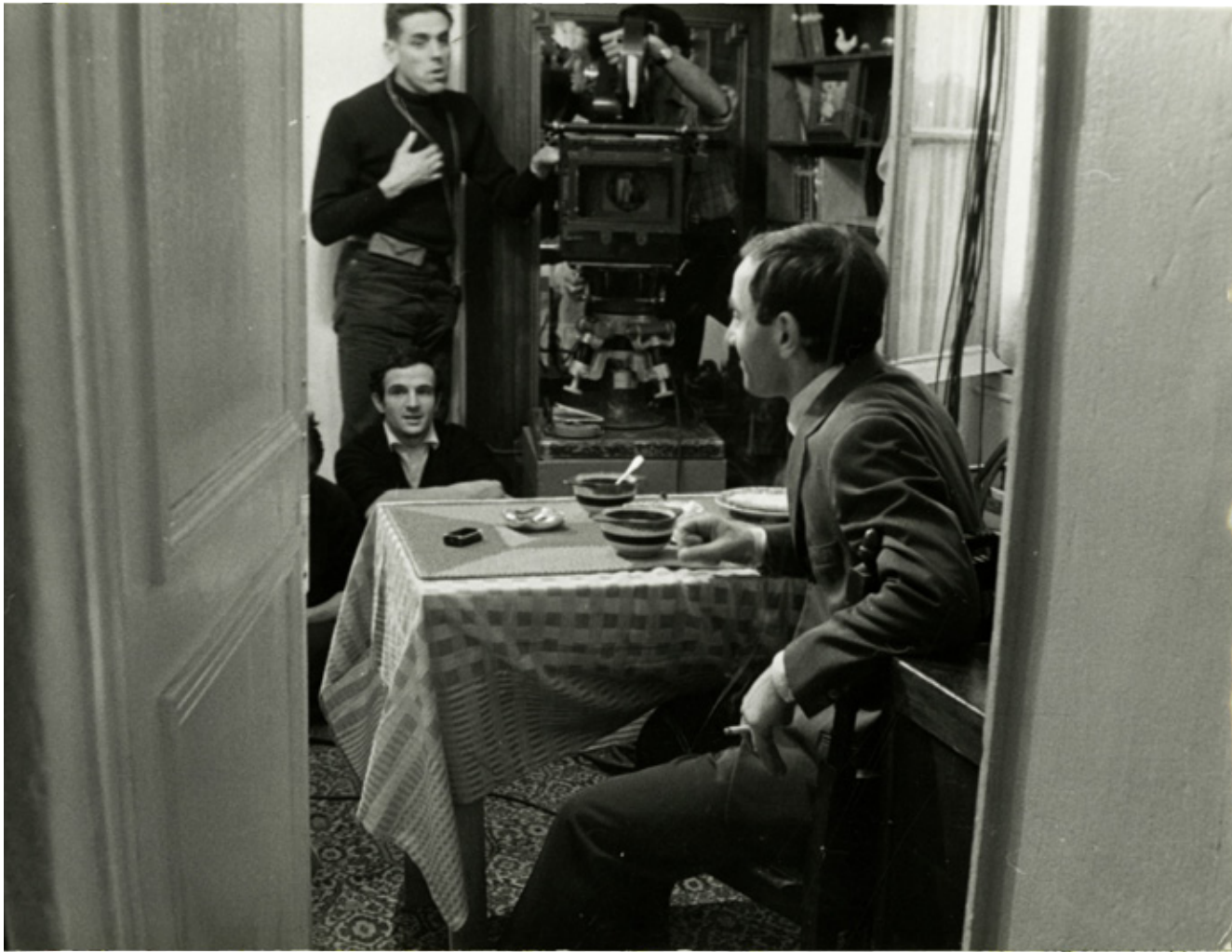
48 UNKNOWN Shoot the Piano Player François Truffaut, 1960

François Truffaut, cinematographer Raoul Coutard, and Charles Aznavour on the set.