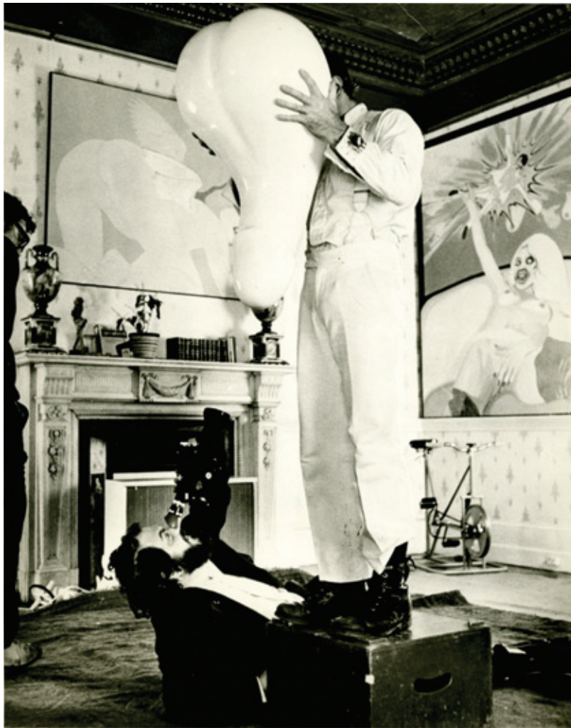
34 UNKNOWN A Clockwork Orange Stanley Kubrick, 1972

Stanley Kubrick and Malcolm McDowell on the set.