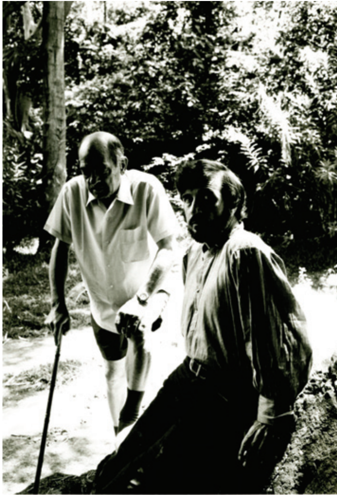
17 MARY ELLEN MARK The Discreet Charm of the Bourgeoisie Luis Buñuel, 1971

Luis Buñuel and screenwriter Jean-Claude Carrière on the set in 1971.