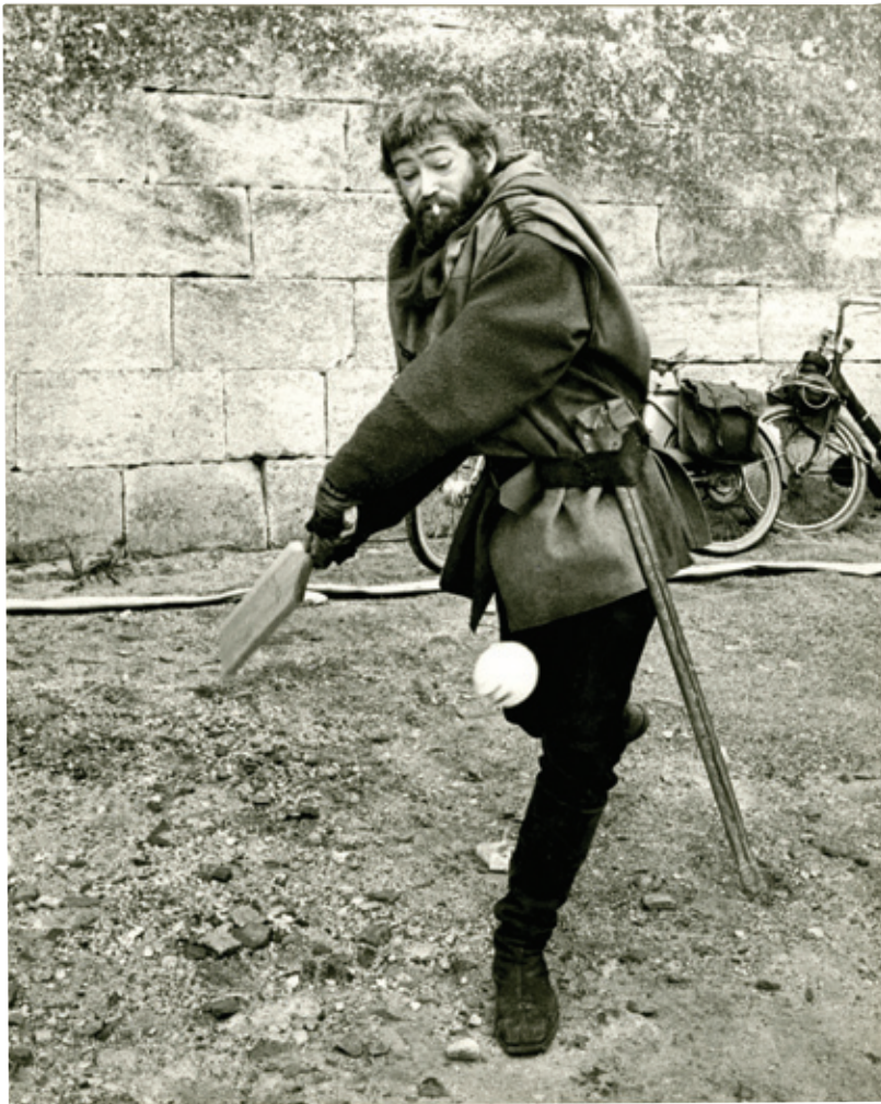
31 The Lion in Winter Anthony Harvey, 1967

Peter O'Toole plays cricket during a break in shooting on location in Arles, France.