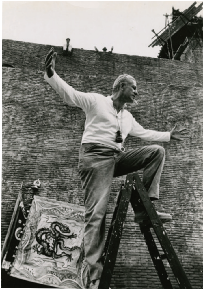
6 55 Days at Peking Nicholas Ray, 1963

Nicholas Ray in his final directorial effort.