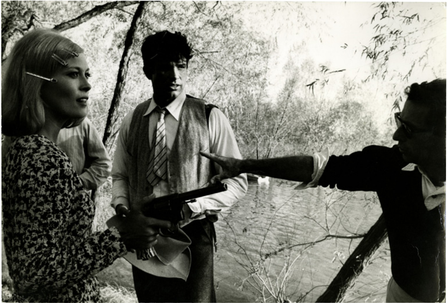
19 Bonnie and Clyde Arthur Penn, 1967

Faye Dunaway, Warren Beatty, and Arthur Penn on location in rural Texas, fall 1966.