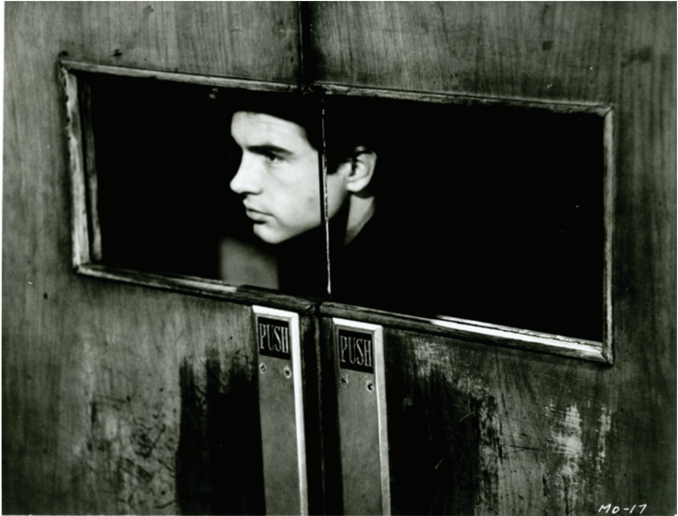
32 UNKNOWN Mickey One Arthur Penn, 1965